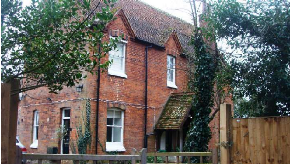
Picture 12. Aston Cottage, dating from the 19th century is located corner of Aston End Road and Benington Road, prominent and distinctive in the street scene.

5.24. Outbuilding to Aston Cottage accessed from Aston End Road. Date contemporary with that of main house. Now garaging. Weather boarded with decorative tiled roof detailing. Whilst the design of the garage doors detract to a degree the buildings are worthy of retention. An Article 4 Direction to provide protection for selected features may be appropriate subject to further consideration and notification.