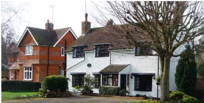
Picture 13. Garden Cottage- a simple elevation which together with adjacent Farm Cottage, makes a worthwhile visual contribution to the street scene.

5.27. Nos. 47-57 Aston End Road. Dating from the mid 20th century these rendered properties with steeply sloping tiled hipped roofs and chimneys are prominent in the street scene. Despite some alterations and satellite dishes their general mass and co ordination of colour and use of traditional materials adds to the quality of the street scene. An Article 4 Direction to provide protection for selected features may be appropriate subject to further consideration and notification.