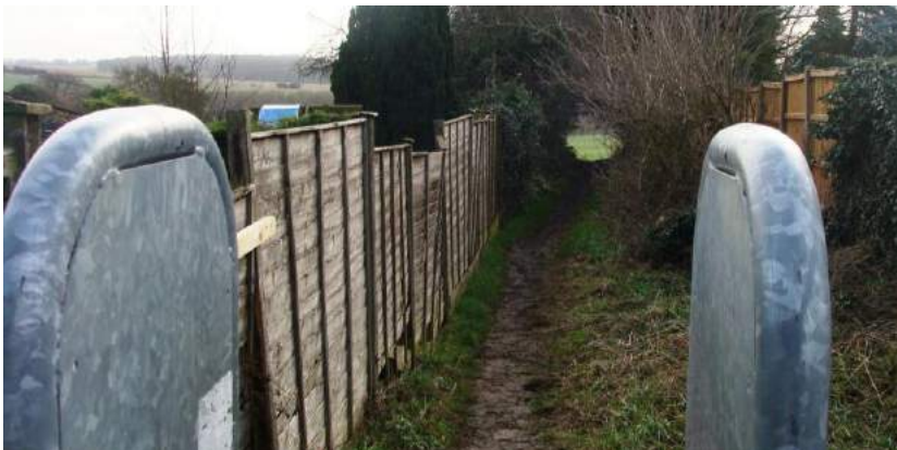
Picture 33. Broken fencing adjacent to footpath detracts. For information the metal guards prevent access by quad bikes.

5.4850. Boundary fencing adjacent to footpath north east end of Stringers Lane. Broken fencing detracts. Replacement would result in significant improvement.