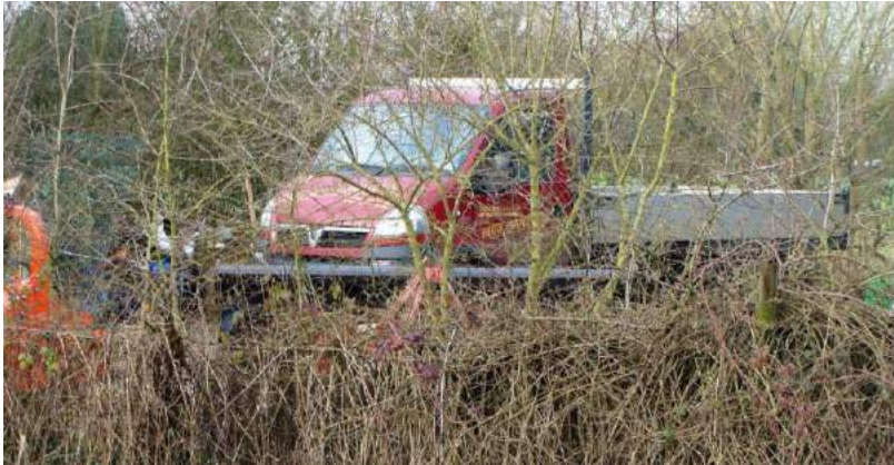
Picture 32. Management and gapping up of frontage hedge to encourage more adequate screening would be beneficial.

5.4850. Boundary fencing adjacent to footpath north east end of Stringers Lane. Broken fencing detracts. Replacement would result in significant improvement.