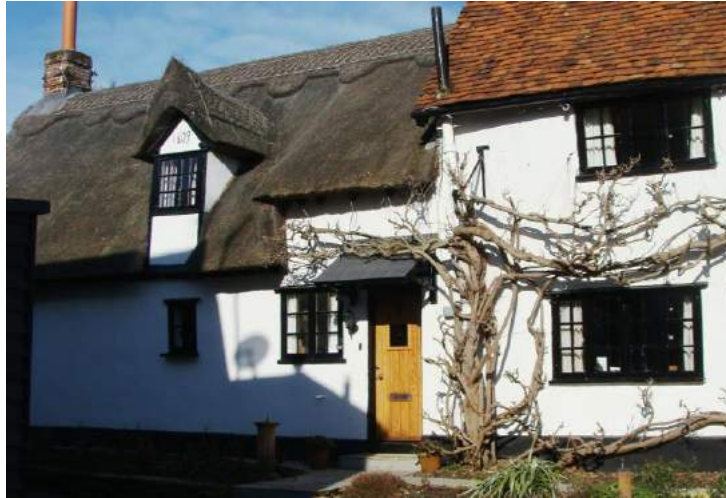
Picture 2. Beehive Cottage picturesque thatched roof dating from the 17th century.

5.10 Nos. 43-45 Benington Road- Grade II*. Mid to late 16 century. Timber frame on painted brick sill, plastered with a steep old red tile roof. A 2-storeys and attics, 2-cell, central chimney, originally lobby entrance plan house facing west. First floor north chamber has a painted scheme of the early 17th century, agreeable with dated examples elsewhere in Hertfordshire of 1605, 4 painted walls with elaborate Jacobean strapwork panelling, with stiles, rails, arabesques and diamonds, colours of yellow, dark red, pale red and black outline. An upper frieze with partly decipherable sententious or pious texts, perhaps from a common source book with those at Pirton Grange, Hertfordshire. Included at Grade II* as a perhaps complete decorative scheme in an otherwise modern house.