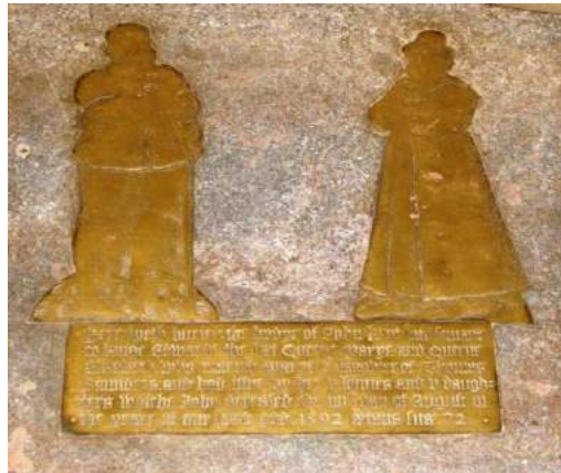
Picture5. 16th century brass to John Kent and wife.

5.13. Parish Church of St Mary the Virgin - Grade II*. Nave and chancel circa 1230, West tower late 14th or early 15th century, low pitched timber roofs and new windows late 15th century, restoration and north aisle 1850. Flint rubble with rough plastered finish and corbelled brick crenellated parapet to tower with stone dressings and tiled buttress offsets. Knapped flint uncoursed facing to rest of church with stone dressings and flushwork chequer of stone and flint on porch. A picturesque irregular church with 2-bay low chancel, taller 3-bay nave with 3-bay arcade and north aisle, square 2-stage tower with large diagonal buttresses. Chancel has 2-bay arched- braced oak roof. Carved and panelled oak choirstalls circa 1886 from St Mary's Lambeth installed 1973. 19th century east window. Oak screen circa 1520 with side panels and central opening. Good figure brass in central aisle before chancel arch, 1592 to John Kent and wife.