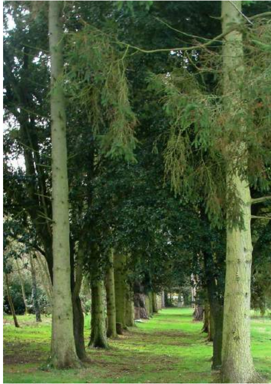
Pictures 24-26. The importance of the open space between Aston Dene and the church. Maintaining its open nature is essential. Top picture shows a very fine Holm Oak tree to right of Aston Dene. Lower picture shows walkway leading to church from Aston Dene. Is there any local knowledge regarding this?

5.38. The Churchyard. The churchyard is a space of high environmental quality with a range of interesting tombstones (one advisedly dating from the 1600's) and native trees of species associated with churchyard planting.