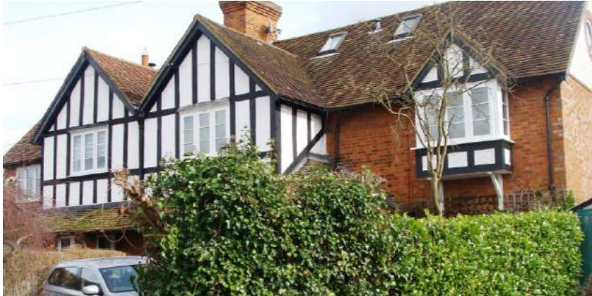
Picture 15. Nos. 34-36 Aston End Road a prominent pair of early 20th century houses which add to the variety of the street scene.

5.29. St Crispins and No. 1 School Lane (The White Cottage). Of late 19th/early 20th century date; a small corner group of two of red brick construction with blue brick pattern. Slate roof with central chimney. St Crispins has central entrance with decorative porch; window to right distinctive and may have been shop window. An Article 4 Direction to provide protection for selected features may be appropriate subject to further consideration and notification.