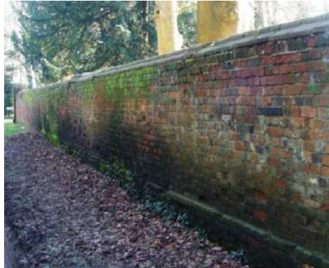
Picture 17. Prominent brick wall that once was the boundary to Aston House. An important architectural and historic feature on this approach.

5.32. Walls to north of Yeomans Drive enclosing properties Nos. 14 and 16 Yeomans Drive. Up to 3m in height and of red brick construction. Of good quality and makes a significant contribution from selected publically accessed locations. Gates with original/early wooden detailing. Area shows on mapping from 1874 to be enclosed and formally planted with typical footpaths associated with a Victorian Kitchen Garden. Some removal of vegetation and repairs would be beneficial.