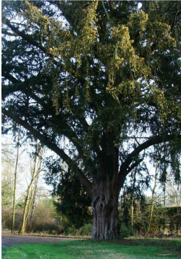
Picture 28. Fine mature Yew tree Yeomans Drive on site of the landscaped gardens of former Aston House. Mapping from 1874-1894 shows such mixed coniferous and deciduous planting in this location.

5.402. Water features. Whitney Pond in the extended conservation area is surrounded by trees with an island that is a nesting area, the fieldworker was informed.