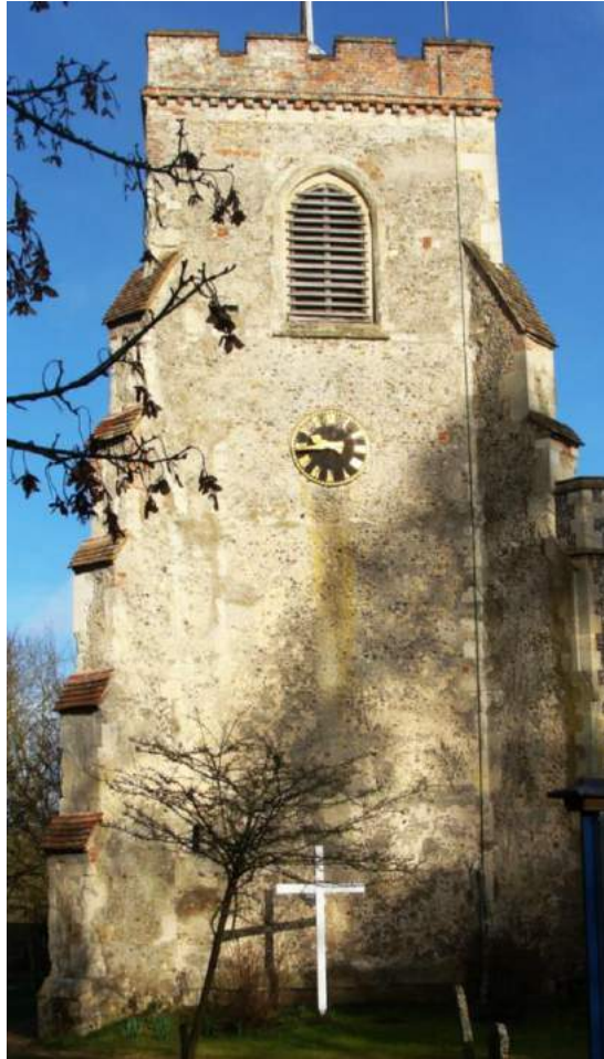
Picture 6. Fine west tower to parish church dating from 14th/15th century. A key feature in the conservation area.

5.14. The Coach House, Yeomans Drive Grade II. Late 17th or early 18th century. Flemish band brickwork with red stretchers, grey headers, red cutter brick band quoins, window arches. Large moulded brick cornice. Hipped tiled roof behind parapet. Central wooden clock turret astride roof ridge carrying octagonal arcaded cupola and wrought iron weather vane. This fine property is the sole survivor of Aston House, the latter complex believed to have been demolished in the 1960's. Are there any local sources of photographs of Aston House and knowledge of the reasons for its demolition?