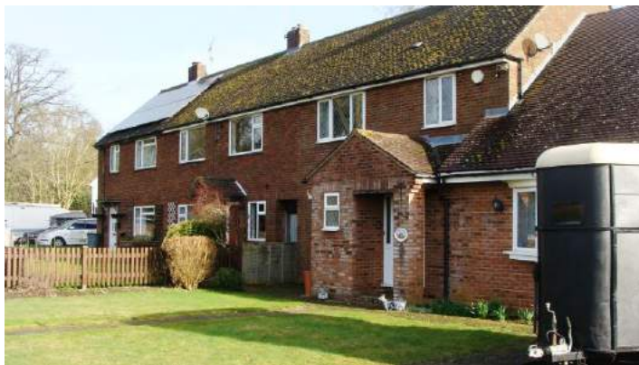
Picture 34. Nos. 3-5 Astonbury Farm Cottages. The original simple lines of these 20th century properties in a peripheral location have been visually compromised by extensions and a large area of solar panels.

(b) Exclude Nos. 3 - 5 Astonbury Farm Cottages. These properties in a peripheral location dating from the mid 20th century are a terrace of three dwellings considered to be of limited historic or architectural interest. Various alterations affecting their original simple and uncomplicated front elevation have been made including an extensive area of solar panels.