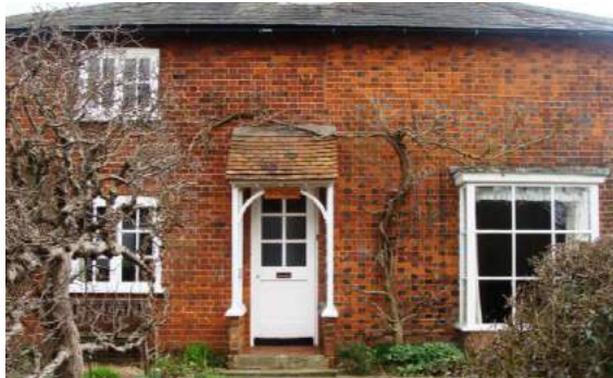
Picture 16. St. Crispins corner of Aston End Road and School Lane. The window to the right is interpreted by the fieldworker as once having been that of a shop. Is there any local knowledge?

5.29. St Crispins and No. 1 School Lane (The White Cottage). Of late 19th/early 20th century date; a small corner group of two of red brick construction with blue brick pattern. Slate roof with central chimney. St Crispins has central entrance with decorative porch; window to right distinctive and may have been shop window. An Article 4 Direction to provide protection for selected features may be appropriate subject to further consideration and notification.