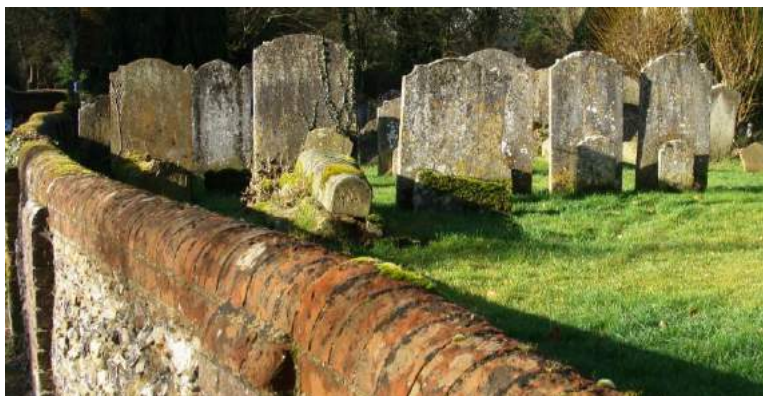
Picture 20. Prominent brick wall to churchyard frontage.

5.33. Wall to frontage of churchyard. A low brick and flint wall with rounded brick capping detailing and pier supports.