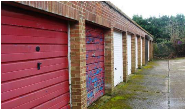
Picture 31. Garaging area north end of Stringers Lane would benefit from general improvements including co-ordinated paint of garage doors.

5.468. Area of single storey garaging north end of Stringers Lane. What is the future of this site? Currently used as lock up garaging/ storage area. In need of repainting.