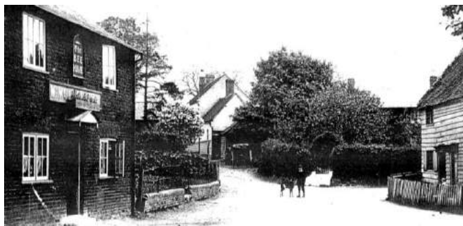
Picture 1. The Beehive. Not featured in the 1874 Kelly's but believed to have been a Beer Retailer and Grocer in the 1880's.

3.9. Commercial activities in addition to farmers listed in Kelly's at this time were a blacksmith, shoemakers (2), beer retailers (3), wheelwright, miller and baker and shopkeepers (2). Two public Houses listed, namely the Rose and Crown and Boot.