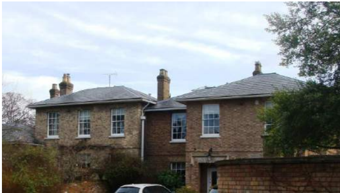
Picture 9. Aston Dene a large 19th century property, in multi ownership, set in extensive grounds and formerly a Rectory.

5.21. The Lodge, formerly associated with Aston Dene. Dates from early 20th century. Single storey of red brick with steeply sloping tiled roof and prominent chimney. Simple bargeboard detailing. Modern windows but of common design which lessens impact. An Article 4 Direction to provide protection for selected features may be appropriate subject to further consideration and notification.