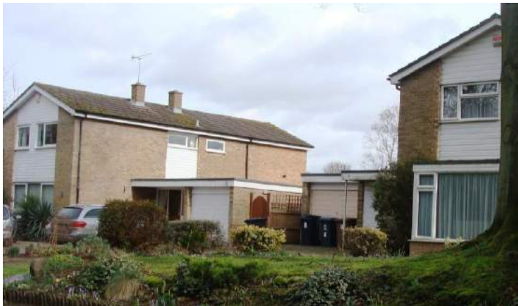
Picture 35. Nos 6-8 Aston End Road. Mid 20th century dwellings with shallow roofs and flat garaging whose peripheral location and lack of architectural/ historic interest warrant their exclusion from the conservation area.

(d) Exclude Nos. 6-8 Aston End Road. These properties are of insufficient historic or architectural quality to be included in the conservation area and being located on a peripheral location their exclusion is easily achieved.