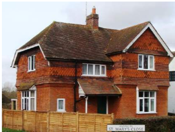
Picture 11. Farm Cottage - a late 19th century house typical of its period and appropriately located in the conservation area.

5.22. Farm Cottage. Of late 19th century date. Two storey of red brick construction with vertically hung decorative tiles; canopy to front. Tiled roof with central chimney. Window detailing later. An Article 4 Direction to provide protection for selected features may be appropriate subject to further consideration and notification.