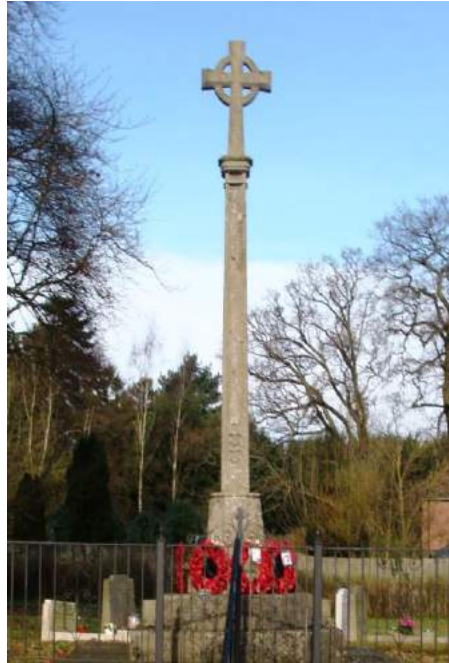
Picture 3. An unusually designed Memorial Cross.