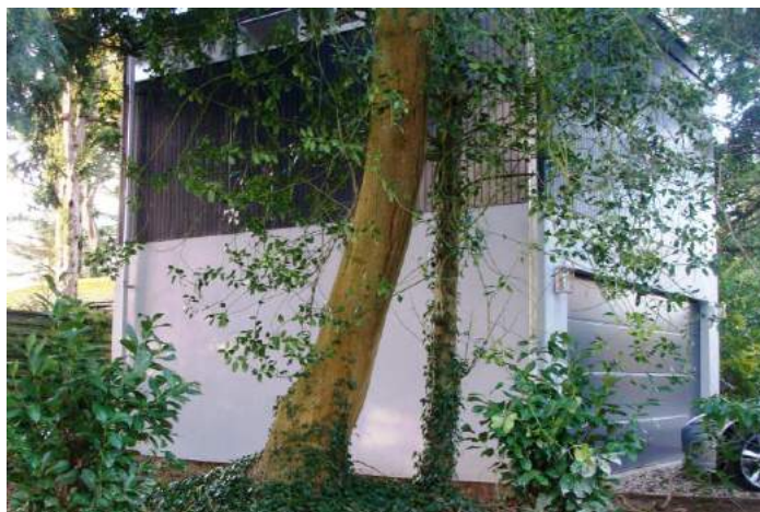
Picture7. Interesting contemporary solution that may have both support and criticism.

5.18. Although not legally 'curtilage listed' as this building post -dates 1948, this represents an interesting contemporary solution for a garage to south of the Coach House. It is appreciated this inclusion may be controversial because of views expressed to the fieldworker regarding a recently approved contemporary solution elsewhere in the village. However there is a place for contemporary solutions even in an historic environment. With the passage of time they may well be considered as being representative of the time in which they were built much as we appreciate the various design solutions of the past.