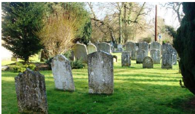
Picture 27. St. Mary's churchyard is most attractive with interesting tombstones trees and flora.

5.38. The Churchyard. The churchyard is a space of high environmental quality with a range of interesting tombstones (one advisedly dating from the 1600's) and native trees of species associated with churchyard planting.