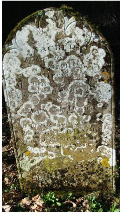
Picture 21. There are many good quality gravestones of architectural, historical and some of ecological interest. These grey lichens in the field workers opinion are most interesting. The British Lichen Society offers advice on the subject.

5.34. Wide range of interesting gravestones in churchyard. Local information advises the earliest dates from the 16th century.