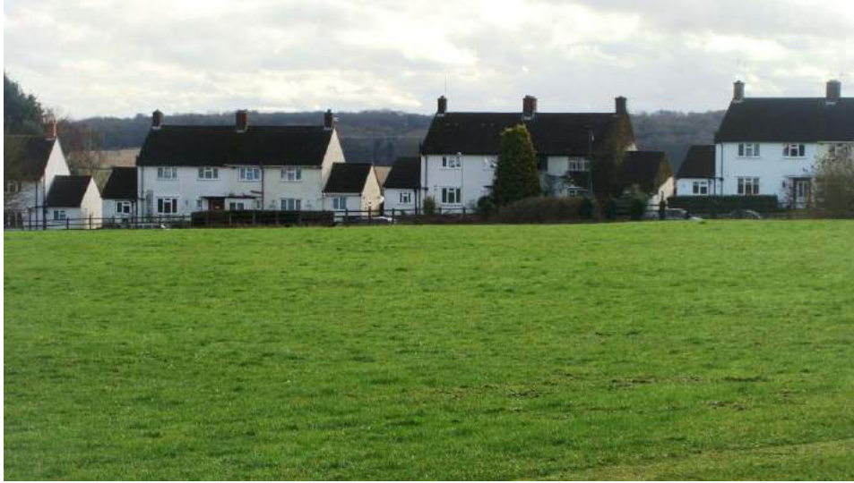
Picture 22. Cricket Pitch in centre of village a quintessentially English village open space that must be protected. It is framed on its south east by housing on Stringers Lane, which although unremarkable, nevertheless retains much of its original form and use of materials.