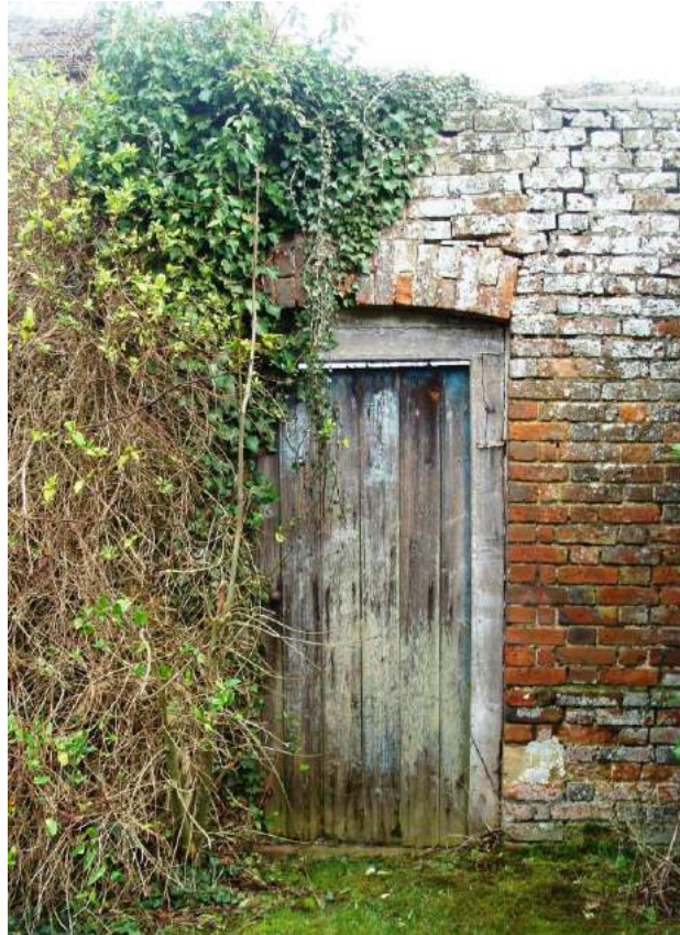
Pictures 18-19. Walls and original/early access. Most likely to have enclosed a Victorian Kitchen Garden from the mid/late 19th century.

5.33. Wall to frontage of churchyard. A low brick and flint wall with rounded brick capping detailing and pier supports.