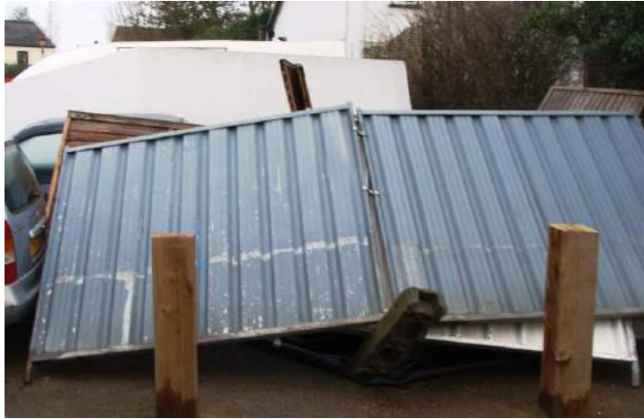
Picture 30. Area to front of Pig and Whistle PH would benefit from general improvement.

5.468. Area of single storey garaging north end of Stringers Lane. What is the future of this site? Currently used as lock up garaging/ storage area. In need of repainting.