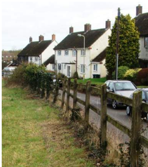
Picture 23. Boundary fencing of the Cricket Ground at Stringers Lane and elsewhere would benefit by being replaced by hedging of native species (of similar height to that of fencing so as to preserve views across).

5.37. Open land between the churchyard and Aston Dene. There is a strong visual and historical link between the church and Aston Dene. The latter gently sloping land can be viewed from the churchyard and there is an historic association in that Aston Dene was one the rectory. On the east is an avenue of trees that may at one time to have provided