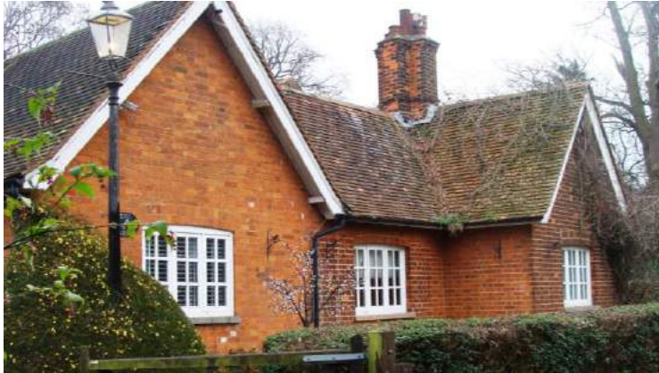
Picture10. The Lodge a pleasantly detailed lodge building which dates from the early 20th century.

5.22. Farm Cottage. Of late 19th century date. Two storey of red brick construction with vertically hung decorative tiles; canopy to front. Tiled roof with central chimney. Window detailing later. An Article 4 Direction to provide protection for selected features may be appropriate subject to further consideration and notification.