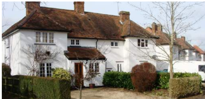
Picture 14. The coordinated mass of Nos. 47- 57 Aston End Road, particularly their roofscape is visually pleasing and as time passes will make an increasing historic contribution to the village.

5.27. Nos. 47-57 Aston End Road. Dating from the mid 20th century these rendered properties with steeply sloping tiled hipped roofs and chimneys are prominent in the street scene. Despite some alterations and satellite dishes their general mass and co ordination of colour and use of traditional materials adds to the quality of the street scene. An Article 4 Direction to provide protection for selected features may be appropriate subject to further consideration and notification.