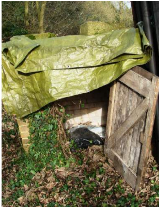
Picture 29. Area adjacent to and rear of cricket pavilion would benefit from minor improvements. Outdoor storage of items little used or used on a season basis could perhaps be stored out of sight.

5.4 46 . Elements out of character with the Conservation Area. Open and enclosed area to rear of cricket pitch. Items associated with maintenance of the cricket pitch could with advantage and little effort be improved.