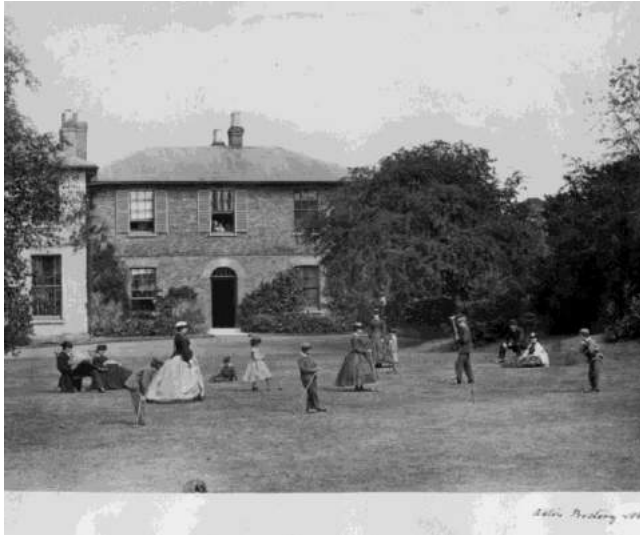
Picture 8. Croquet at Aston Rectory during the 19th century.

construction with slate roofs and tall chimney stacks with pots. Good quality detailing including front door detailing, rubbed brick lintels and many good quality windows. In expansive grounds rising up to the church. An Article 4 Direction to provide protection for selected features may be appropriate subject to further consideration and notification.